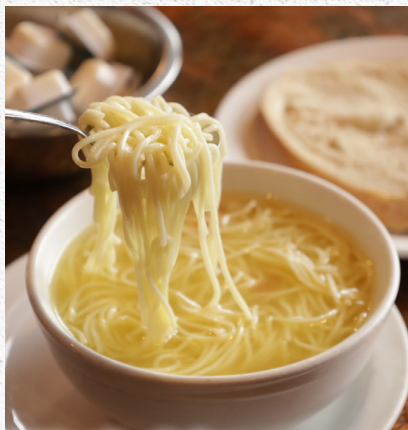
Chicken Noodle Soup