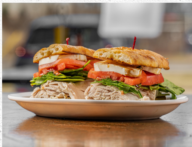
Turkey Pesto Sub