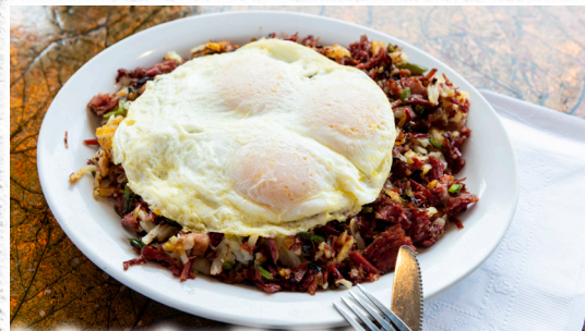
Our Famous Corned Beef Hash