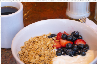
Good Morning Granola Bowl